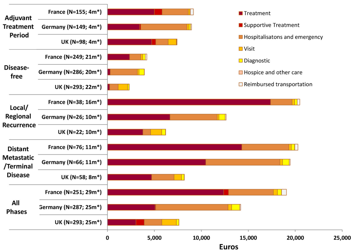
Fig. 3. Direct costs (per patient) associated with NSCLC over the follow-up period by country for the major direct resource category (medical record abstraction). Country (n = x), y = number of patients and mean duration of follow-up for the specified phase and country.

Treatment costs = systemic therapy, radiotherapy, gamma knife procedures, brachytherapy, laser surgery, photodynamic therapy, and embolization, and are obtained by adding up the treatments during the adjuvant treatment period during the no-recurrence period and systemic therapy and chemotherapy received during later phases along with the associated administration costs.